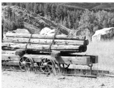
Photo: Bellevue Mines, Alberta